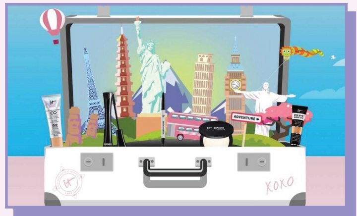
An image from the opening animation of IT Cosmetics' Journey LMS